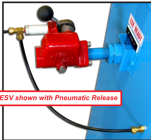
ESV shown with Pneumatic Release