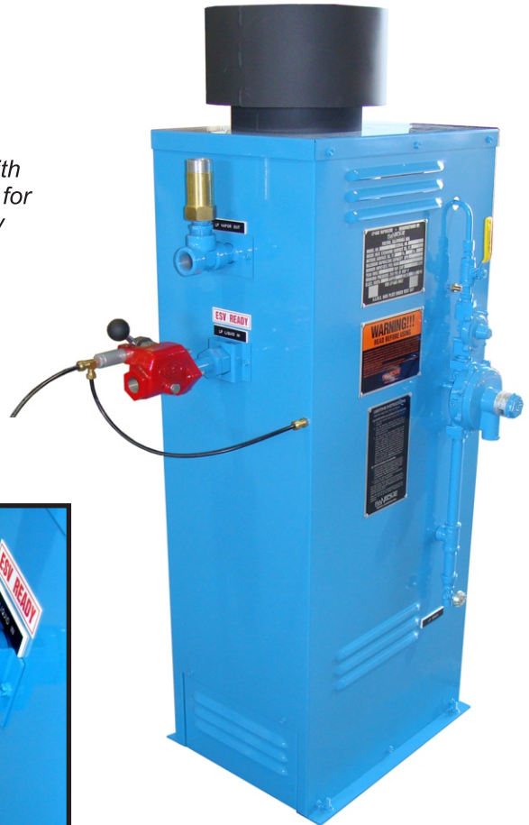
ME980907B Brass Pneumatic Fittings

Vaporizers Pre-Plumbed with Remote Thermal Elements for Pneumatic Means of Safety Shut-Down.