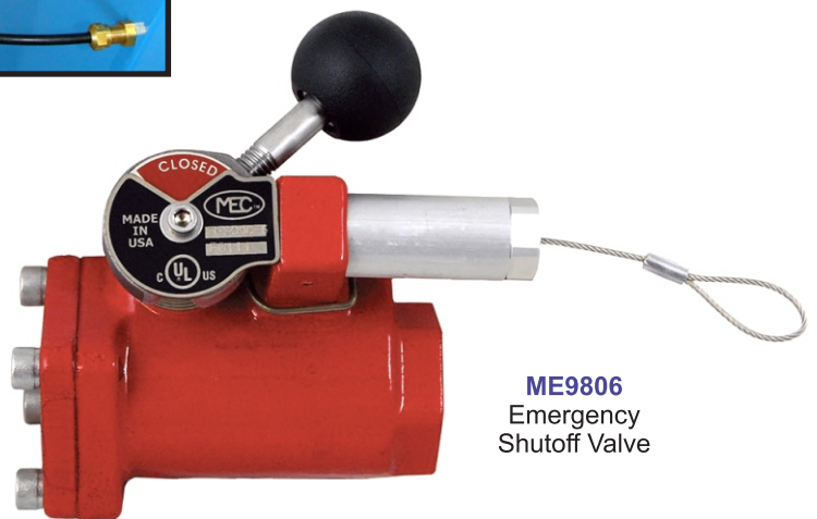
ME9806 Emergency Shutoff Valve